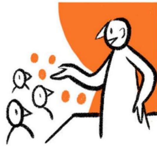
Has been in a play