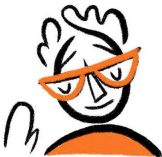
Is wearing glasses