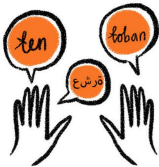
Can count to 10 in 3 languages