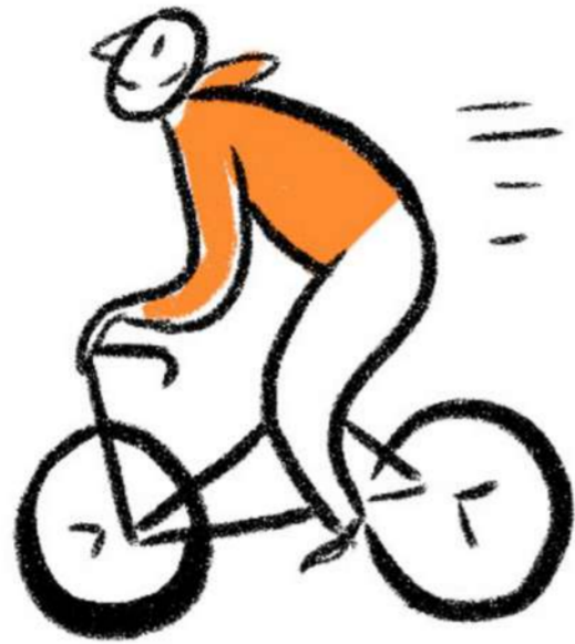
Can ride a bike