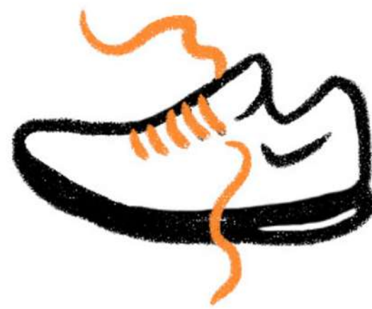
Is wearing white trainers