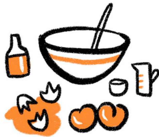
Likes to cook