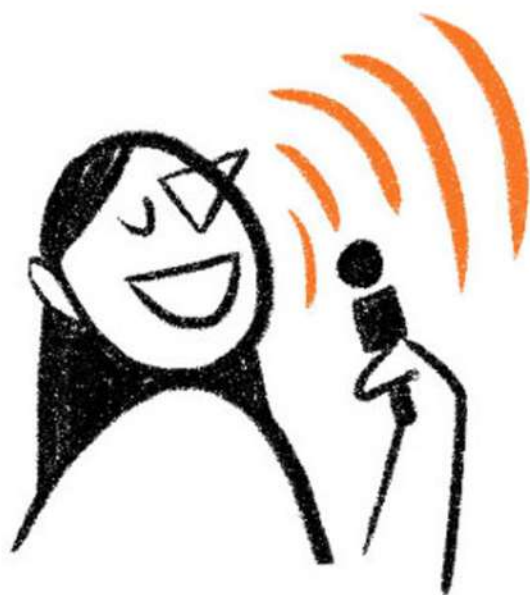
Can sing a song