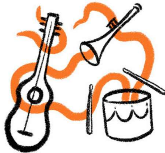
Can play an instrument