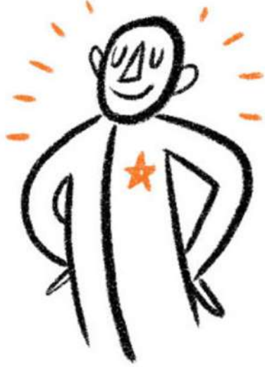
Can tell you something they are proud of