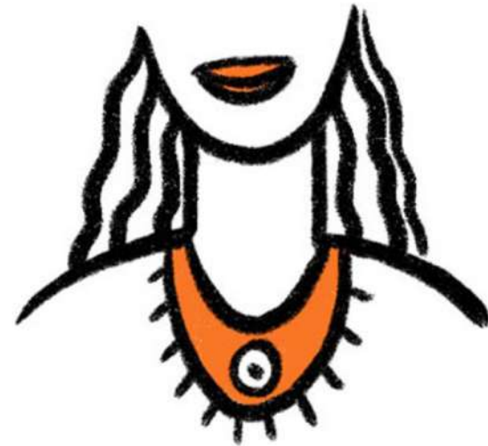
Is wearing a necklace