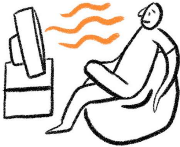
Likes the same TV show as you